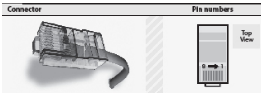
Exhibit D A male RJ-45 connector

A well-thought-out standard for RJ-45 to DB-25 wiring was created by Dave Yost. If you're planning to use a significant amount of serial cabling, be sure to check it out at yost.com/computers/RJ45-serial .