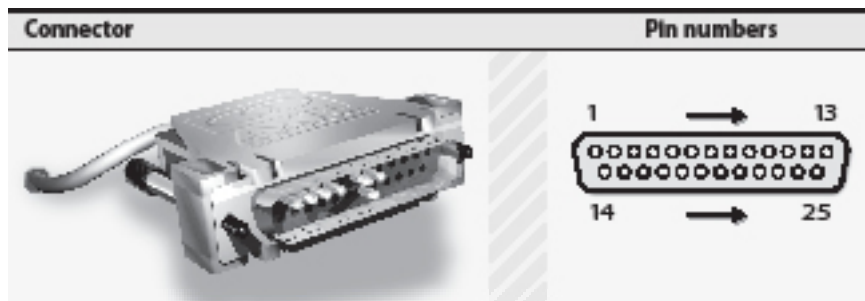
Exhibit A A male DB-25 connector

Full RS-232C 1 is never used in real-world situations since it defines numerous signals that are unnecessary for basic communication. DB-25 connectors are also inconveniently large. As a result, 9-pin DB-9 connectors are now commonly used instead of the original 25-pin flavor. In cases where structured cabling is used, RJ-45 connectors are also a convenient alternative. Both of these connectors are described in the section titled Alternative connectors starting on page 1446.